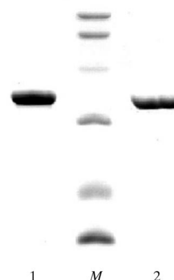
Figure 1 Coomassie-stained SDS–PAGE showing human 3 \alpha -hydroxysteroid dehydrogenase from purification or from dissolved crystals. Lane M , molecular-weight markers (from top): 97.4, 66.2, 45, 31, 21.5 and 14.4 kDa; lane 1, purified human 3 \alpha -HSD; lane 2, protein sample from dissolved crystals of human 3 \alpha -HSD ternary complex.

The data-collection statistics and unit-cell parameters are given in Table 1. Crystal form I was used for molecular-replacement